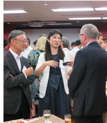
The symposium and networking event to commemorate the launch of UC San Diego's Tokyo Office