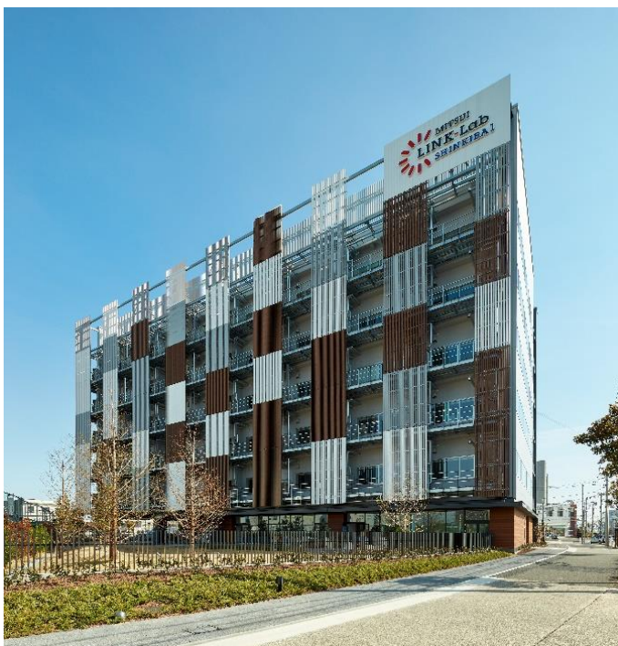
External view of MITSUI LINK-Lab SHINKIBA 1